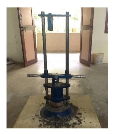
Fig. 1. Impact test device