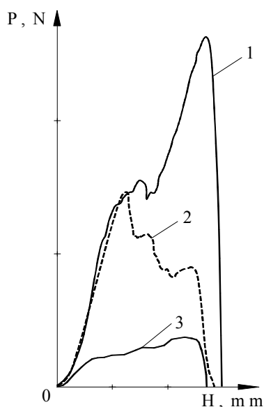
Fig. 1. Typical extraction curves H-P : 1 – woven fabric, 2, 3 – knitted fabrics

Other parameters: the distance between limiting plates h and the weight of specimen m were determined separately. The variation of fabric thickness \Delta\delta due to the changes