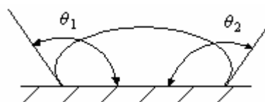
Fig. 3. Tangent lines at the borders of the drop

Windows™ software is used to process images acquired by the video camera and digitizing card of the DSA10 system. Software uses a special algorithm to define the drop boundary reliably. Images of sessile drops are fitted to yield contact angle data. Contact angles are measured at the tangent lines to the surface and the mean value \theta = (\theta_1 + \theta_2) / 2 is calculated (Fig. 3).